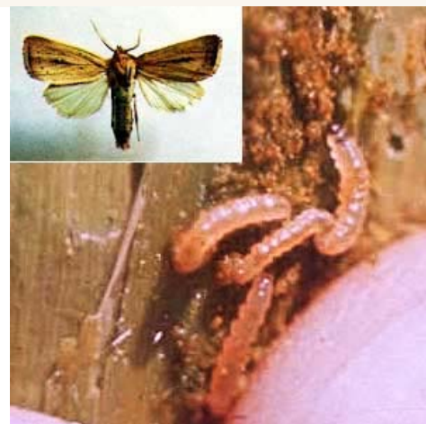
Pink Stalk Borer caterpillars and moth

The Pink stalk borer lays eggs on either the lower leaf sheaths or on cobs. Young caterpillars burrow directly into the stem or cob. These insects are major pests in winter rainfall regions.